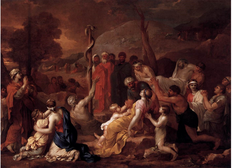
BOURDON, Sébastien , Moses and the Brazen Serpent , 1653-54, Museo del Prado, Madrid

Fourth Sunday in Lent March 10, 2023 — 9:00 am